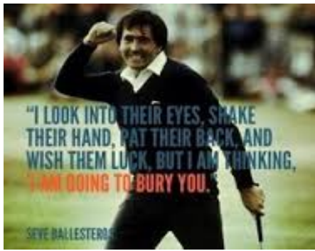
SEVE BALLESTEROS - GOLFING GENIUS - DIED 7 MAY 2011